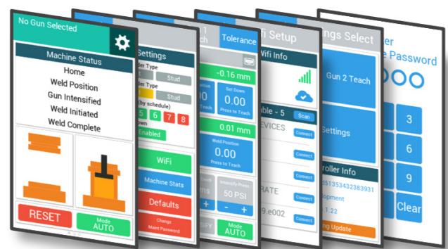
Simple Standardized Operator Interface

Contact us today to request a quote on the CLCS FlexFast™ Lite.